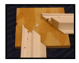
NOTE: A small wood block is recommended to prevent damage to floor and to ensure a flush fit by the Hoffman Key

4. Position the left frame and the top frame onto a flat surface and line up the Hoffman key.