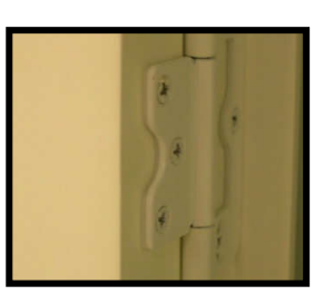
Hinge spacer installed

15. Once reveal is aligned, secure the bottom frame. Repeat step 16 for the top frame.