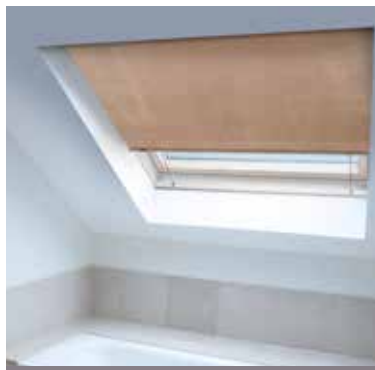
SmartFit™ for sloped windows