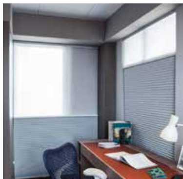
Day & Night Honeycomb