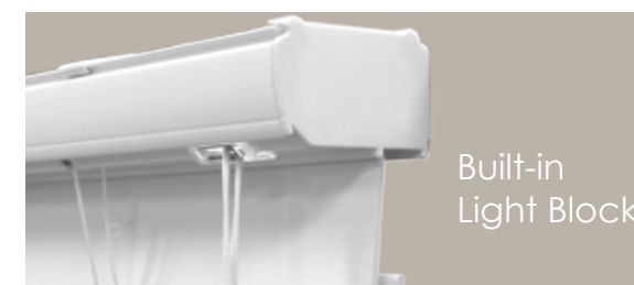
Built-in Light Block