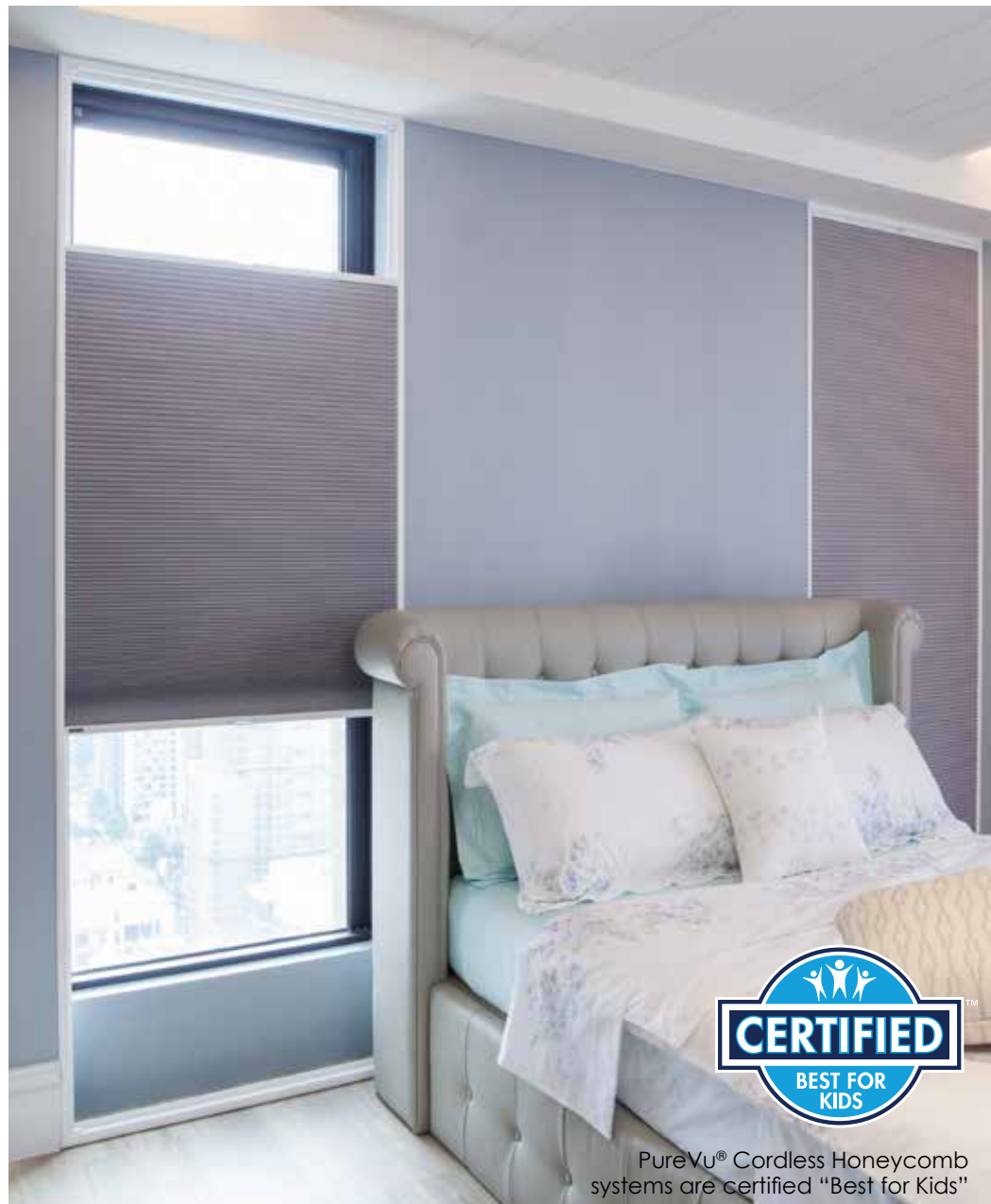
PureVu® Cordless Honeycomb systems are certified "Best for Kids"