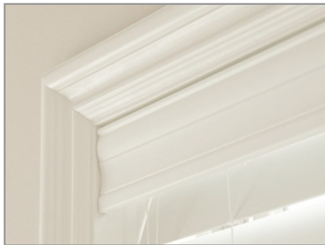
Designer Crown Valance